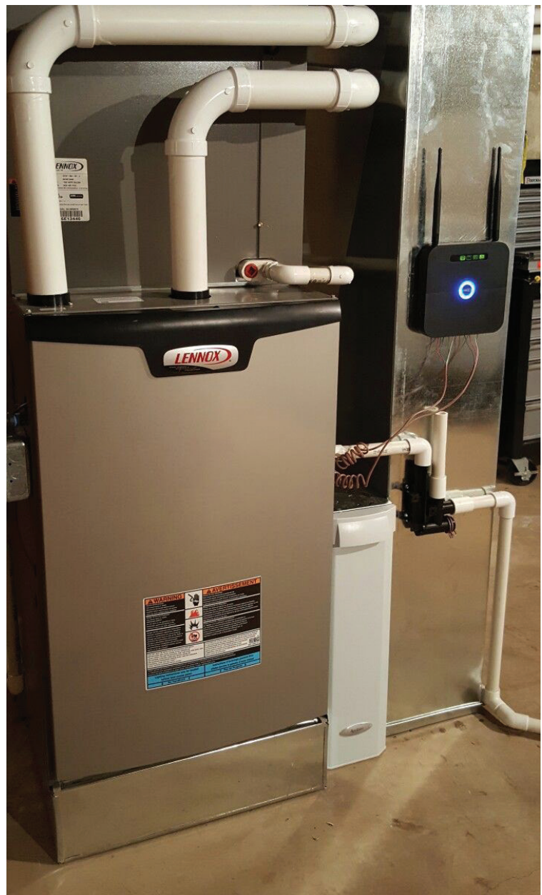
With fall upon us, now is the time to prepare your home heating system for the winter months, both to extend the efficiency of your HVAC system and ensure your family stays comfortable throughout the season. (Photo courtesy: Northern Air).

To optimize your HVAC system, Northern Air offers a Peak