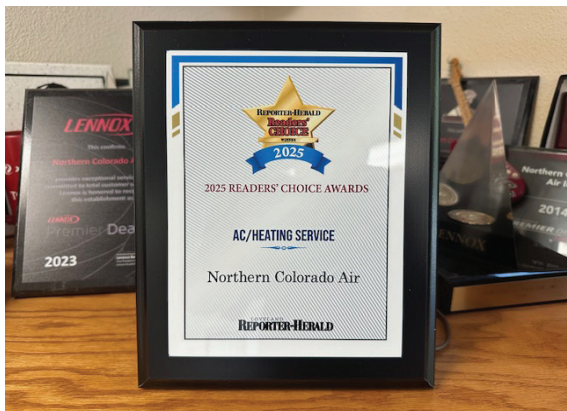
Northern Air (formerly Northern Colorado Air), was named 2025 Best AC/Heating Service by the Loveland Reporter-Herald's Readers' Choice Awards

Northern Air is now booking furnace maintenance and home humidification appointments. For more information or to secure a heat pump rebate before Nov. 16, contact Northern Air at 970.223.8873 or visit ncagriff.com.