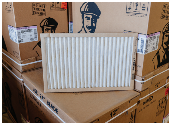
Northern Air's stocks the top performing filters available in their warehouse.