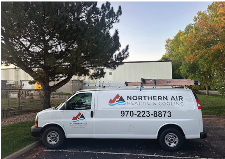
One of the simplest and most important things a homeowner can do to maintain their HVAC system may be the most overlooked: changing the air filter. Northern Colorado Air's stocks the top performing filters available in their warehouse.