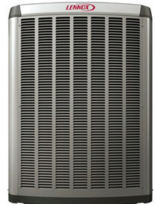
Lennox heat pumps offer efficiency - rebates are offered through Nov. 16.